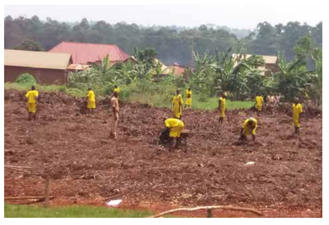
The sugar cane field being cleared for new boarding houses.

Twinkle School were so excited to know they were getting new dormitories. We were able to tell them due to the success of the dinner, and the kindness of our supporters, that they would have a safe and comfortable place to live. Within a week the land, which was being used for sugar cane, had been harvested and cleared ready to start the new dormitories!